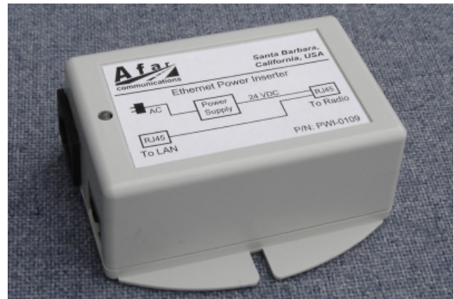
PWI-0109: Ethernet Power Inserter for AC power source